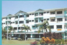
New Female Hostel (Susanna Hall, completed in 2003)