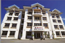
MTS Administrative Building (Completed in 1998)