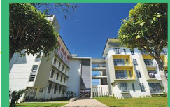
Four-storey Male & Married student, and Lecturers' Apartment (Completed in 2011)

After 20 years of using the MTS Administrative Building, due to the limitation of space, we were forced to utilize the only conference room and chapel for classes, seminars, and Short-term Missions School. We foresee more space needed for our future development of using Bahasa Malaysia as a medium of instruction.